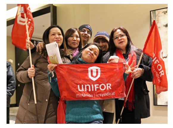
Workers at two downtown Toronto hotels have voted to join Unifor, with more votes to follow next week.